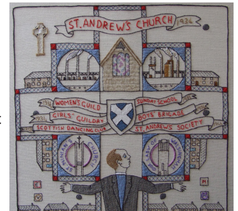
St Andrew's Church (GBE 04)